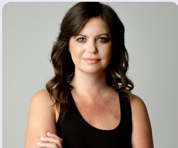
Dame Deborah James

We're truly grateful to have known Deborah and to call her our friend. She was a powerful patron for Bowel Cancer UK, and we're determined to ensure her lasting legacy by continuing to raise awareness of bowel cancer and its symptoms, pushing for earlier diagnosis of the disease, and ultimately, saving lives.