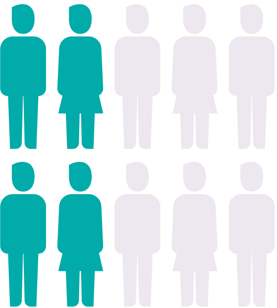
Fewer than 4 in 10 people diagnosed at stages 1 and 2